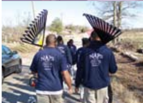
NAPS helping tornado victims in Moulton, AL.