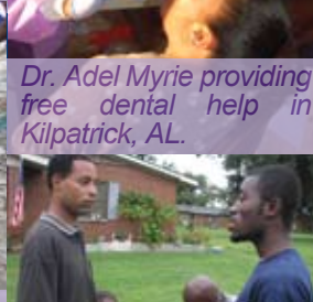
Sharing God's love on the streets of Huntsville.