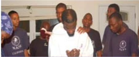
YOD praying with a man wanting a new life in Tampa, FL.