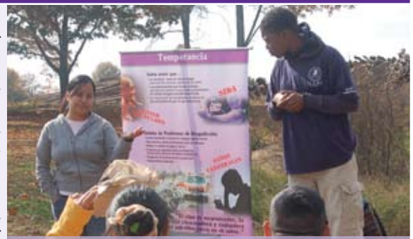
Health Fair in Kilpatrick, AL in the Hispanic community, who have no healthcare.

This year NAPS is working in 6 communities in the Huntsville-Decatur Alabama area conducting children's programs, Bible studies and health screenings. The medical team has recently conducted a health fair with Agape Spanish Church in the Hispanic community of Kilpatrick, AL, and is working toward doing routine physicals and hydrotherapy. The training received locally will prepare volunteers for overseas missions this summer to Angola and Namibia.