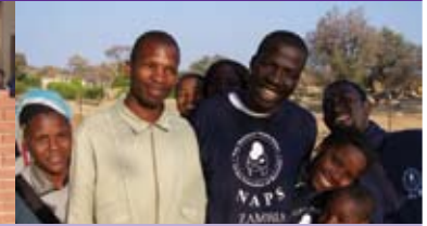
Above left: NAPS members from Zambia and Botswana teaching about God's love together at a primary school. Above right: Members and trainees from Botswana, South Africa, Zambia, Zimbabwe, and the US. Bottom left: AIDS march in Francistown. Bottom right: Children's program at Sildwane School in Tutume.