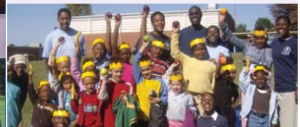
NAPS encouraging the children to make healthy food choices.