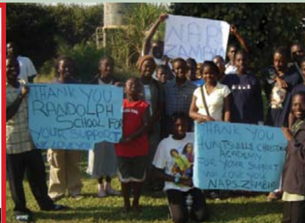
The Jr. NAPS branch in Lusaka, Zambia, holds posters thanking the staff and students of the Randolph School and Huntville Christian Academy for their far-reaching support.