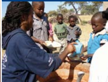
Above: During the course of the summer, NAPS fed over 6000 people in Zimbabwe.

Zimbabwe has gone from being the "Bread Basket of Africa" to being on the brink of starvation. The failing economy, the prolonged drought, and the persistent HIV/AIDS crisis have created widespread distress. Presently, most staple foods are only available on the black market and, due to the rise in fuel pricing, transportation has nearly come to a standstill. Hospitals are without