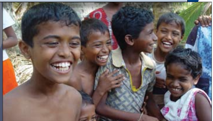
"The Million-Dollar Photo": Love changes things--the children are smiling again.