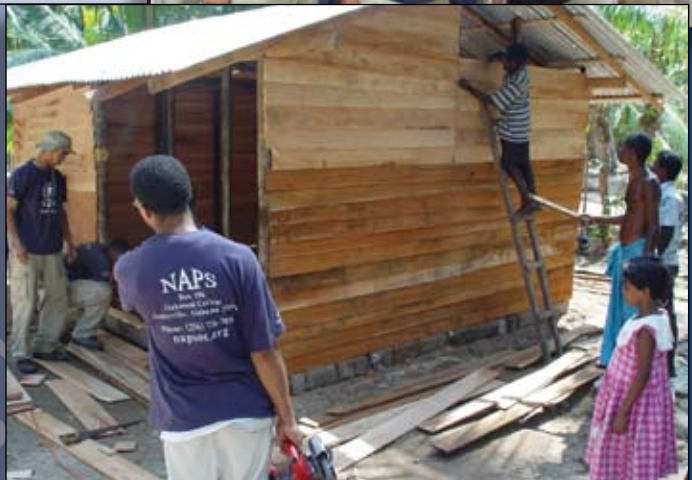
NAPS has built five homes for the tsunami victims.