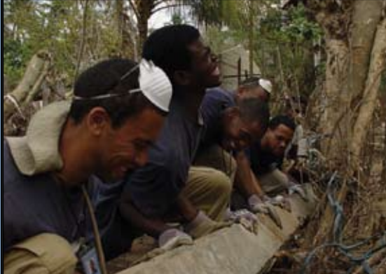
Clearing debris to make way for new homes.

In July 2005, a second group of students will be dedicating a year of their lives to serving others. The Y.O.D. 2 crew will begin their year by completing a NAPS Training Center, which will be used to train fellow Oakwood students and civilians for missionary work. Then they will devote their time doing motivational talks at schools, hospital visits, juvenile detention center programs, and spreading the Gospel through literature evangelism as well. As humble servants of the Lord, they desire to replicate the Y.O.D. I group's success and mission of "No Soul Left Behind."