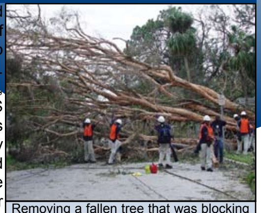
Removing a fallen tree that was blocking the street

In response to our hurting brothers and sisters, NAPS departed on two missions of mercy. On September 5th, NAPS went to Florida to help victims Hurricane Frances. Two weeks later, a team went to Mobile, AL, to assist those hurt by Hurricane Ivan. NAPS cut down fallen trees and removed debris from the yards of damaged homes. They also distributed water and food to neglected victims in project communities and lifted the spirits of many through the music of their marching band.