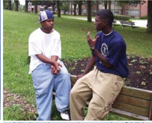
Ministering to the youth of NY