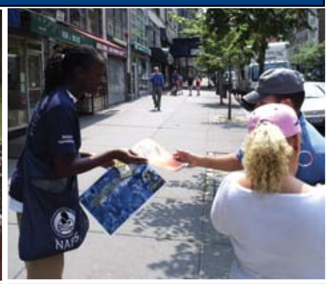
Sharing Christ-filled literature

Burdened by the devastating troubles facing the youth of today, 15 NAPS volunteers have decided to dedicate their 2004-2005 school year to help mitigate poverty in India and live as examples for wayward youth in America.